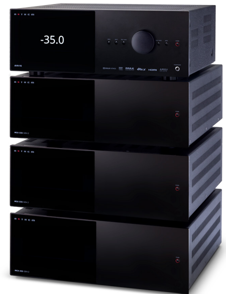
Three MCA 525s (Gen. 2) paired with an AVM 90 A/V Processor

Create Your Own Dolby Atmos 15-Channel System