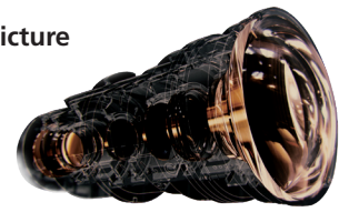
High-quality 65 mm diameter, 17-element, 15-group all glass lens

The DLA-NP5 is equipped with a 65mm diameter, high resolution, 17 element, 15 group all glass lens to deliver 4K resolution on the screen. For excellent installation flexibility, a wide shift range of +/-80% vertical, +/-34% horizontal is offered.