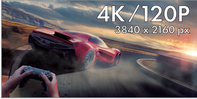
From Blu-ray and gaming consoles to 4K streaming services, native 4K content can be enjoyed to its fullest on JVC D-ILA projectors without conducting any upscaling process.

The DLA-NP5 offers dual 48Gbps HDMI inputs with HDCP 2.3. 4K/120P input is supported for the newest generation video content, including the latest gaming platforms.