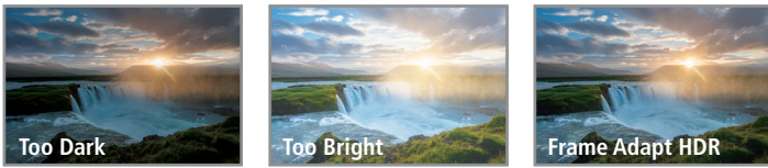
JVC projectors featuring Frame Adapt HDR and Theater Optimizer can express HDR content at optimum brightness and darkness in each frame as the creator intended.

The DLA-NP5 is compatible with HDR10 content such as UHD Blu-ray and streaming. Color grading of HDR content can vary dramatically. Frame Adapt HDR dynamically tone maps all HDR10 content for optimized brightness, color and detail on a frame by frame or scene by scene basis. With Theater Optimizer, JVC has created the world's first projector that automatically fine tunes HDR based on installation characteristics, projector settings and even lamp age.